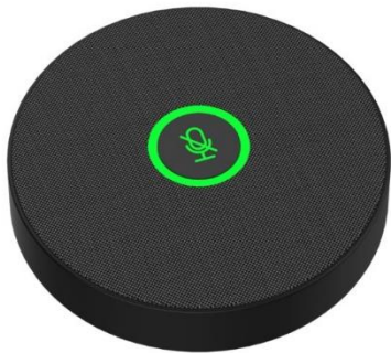
Figure 2: Microphone Array Front