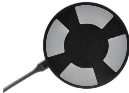
Figure 3: Microphone Array Back